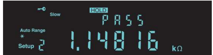
Limit compare mode on the DMM4020.

Dedicated front-panel buttons provide fast access to frequently used functions and parameters, reducing setup time. You no longer need to search through software menus to find the function you need.